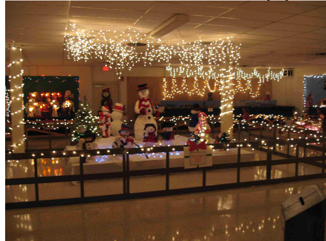
This view from the display room entryway at Shirley's Cinema shows why many visitors thought there was no train layout to see this year when they first came in.

where it had been during previous years. Several said they were really disappointed when they came into the room, didn't see the layout at first, and thought there weren't any trains on display. They and many others said our trains were the main reason they came out to Christmas Lane. I did an unscientific survey by casually